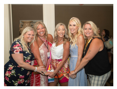
Build Life-Long Friendships

The most important things in life are NOT THINGS... they are RELATIONSHIPS!