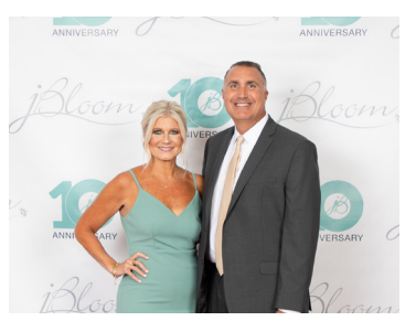
Experience Faith-Based, Servant-Heart Leaders with a Long-Term Vision & Growth Plan