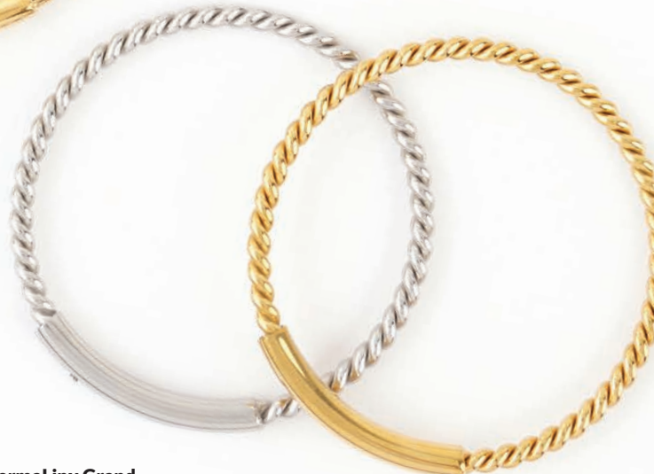
PermaLinx Grand Twist Bangle