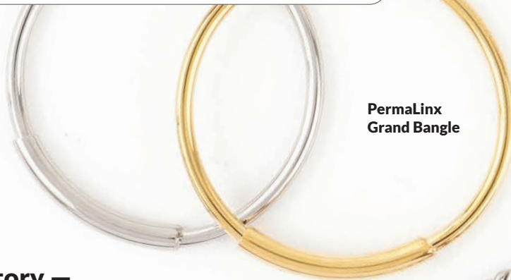
PermaLinx Grand Bangle