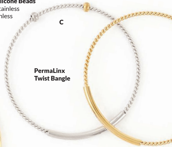
PermaLinx Twist Bangle